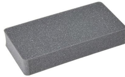
1062 Pick N Pluck™ Foam Insert