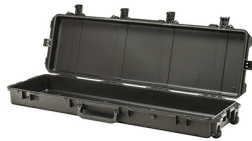
iM3300-X0000 No Foam