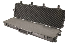
iM3300-X0001 With Foam