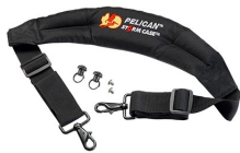
iM-STRAP-S-VER2 Padded Shoulder Strap