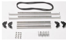
iM27XX-BEZEL-LID Lid Bezel Kit