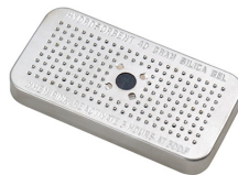
1500D Desiccant Silica Gel