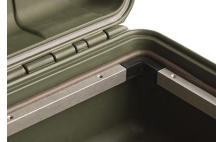
iM27XX-BEZEL Base Bezel Kit