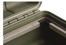
iM2500-BEZEL Base Bezel Kit