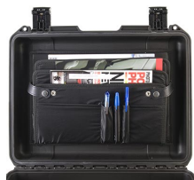
iM24XX-LIDORG Lid Organizer