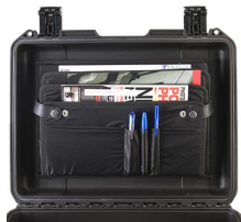
iM24XX-LIDORG Lid Organizer