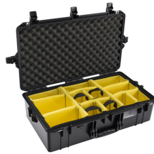
1605WD With Padded Dividers