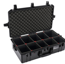
1605TP With TrekPak Divider System