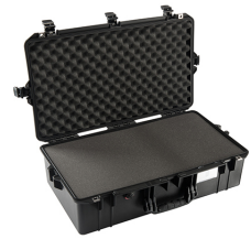
1605WF With Foam