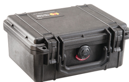
1150NF No Foam