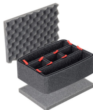
1150TPKIT TrekPak Case Divider Kit