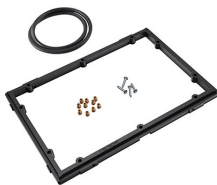
1150PF Special Application Panel Frame