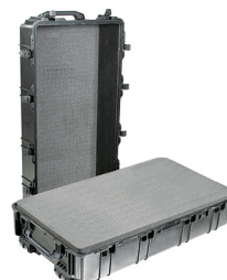
1780WF With Foam