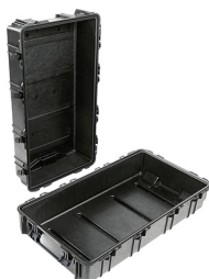
1780NF No Foam