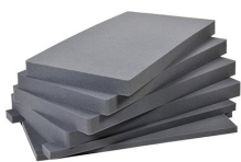
1781 6 pc. Replacement Foam Set