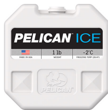
PI-1LB 1lb Ice Pack