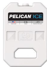
PI-2LB 2lb Ice Pack

Pelican 23215 Early Ave • Torrance, CA 90505 USA • Phone: (310) 326-4700 • (800) 473-5422 • Fax: (310) 326-3311 sales@pelican.com • www.pelican.com