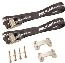
TDKIT Tie Down Kit