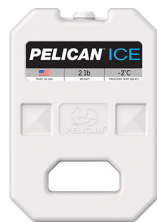
PI-2LB 2lb Ice Pack

Pelican 23215 Early Ave • Torrance, CA 90505 USA • Phone: (310) 326-4700 • (800) 473-5422 • Fax: (310) 326-3311 sales@pelican.com • www.pelican.com