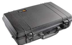
1490NF No Foam