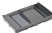
1499C Computer Bottom Insert