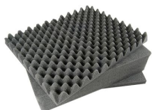
1491 3 pc. Replacement Foam Set