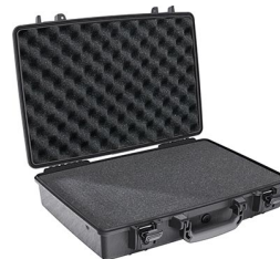
1490WF With Foam