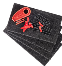
1506TPKIT TrekPak Case Divider Kit