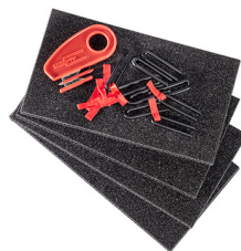
1506TPKIT TrekPak Case Divider Kit

23215 Early Ave • Torrance, CA 90505 USA • Phone: (310) 326-4700 • (800) 473-5422 • Fax: (310) 326-3311 sales@pelican.com • www.pelican.com