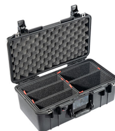
1506TP With TrekPak Divider System