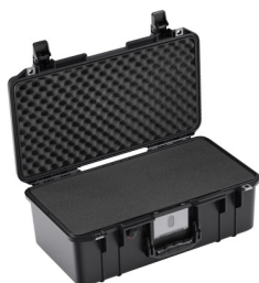
1506WF With Foam