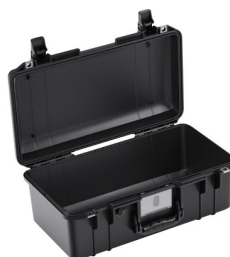
1506NF No Foam