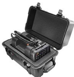
1460AALG 1460 Case with custom fit foam

Pelican 23215 Early Ave • Torrance, CA 90505 USA • Phone: (310) 326-4700 • (800) 473-5422 • Fax: (310) 326-3311 sales@pelican.com • www.pelican.com