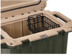
50-WB Dry Rack Basket