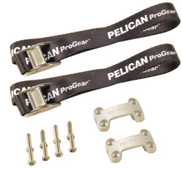
TDKIT Tie Down Kit