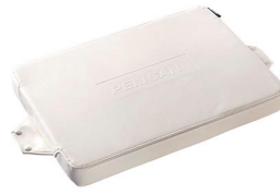
50Q-SEAT-WHT Seat Cushion - White