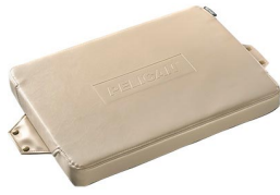
50Q-SEAT-TAN Seat Cushion - Tan