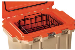
30-WB Dry Rack Basket