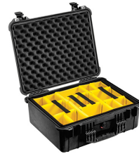
1554 With Padded Dividers