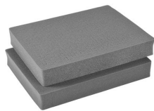
1552 Pick N Pluck™ Sections Only (set of 2)