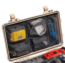
1519 Lid Organizer