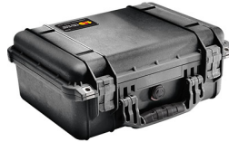
1450NF No Foam