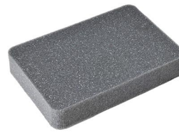
1052 Pick N Pluck™ Foam Insert