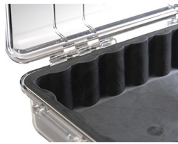
1051 Replacement Case Liner