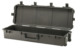
iM3220-X0000 No Foam