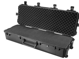
iM3220-X0001 With Foam