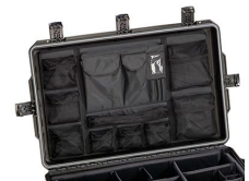
iM29XX-UTILITYORG Utility Organizer