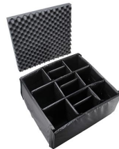
iM2875-DIV Padded Divider Set