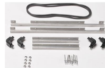
iM2500-BEZEL-LID Lid Bezel Kit