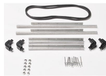
iM24XX-BEZEL-LID Lid Bezel Kit