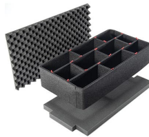
1615TPKIT TrekPak Case Divider Kit