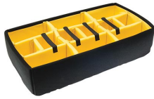
1615AirDS Padded Divider Set