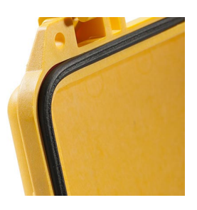
1073 Replacement O-ring