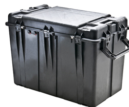
0500WF With Foam