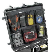
1699 Lid Organizer