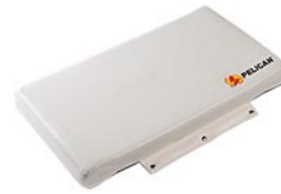
65-95QSEAT Seat Cushion - White