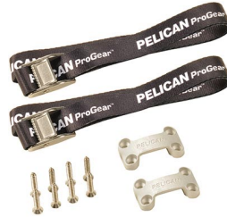
TDKIT Tie Down Kit