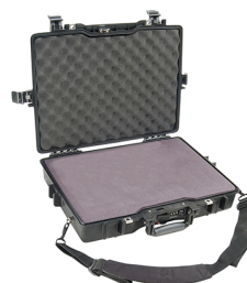
1495WF With Foam