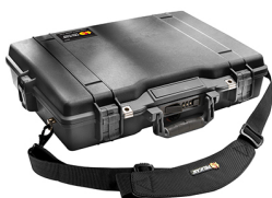
1495NF No Foam