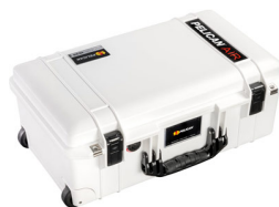
1535WWF With Foam