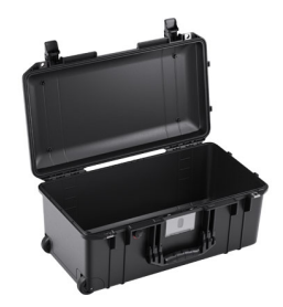
1556NF No Foam