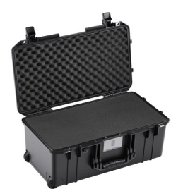
1556WF With Foam