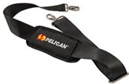
9487 Padded Shoulder Strap