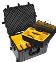
1637WD With Padded Dividers