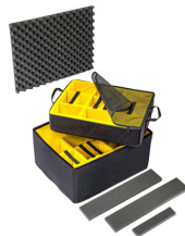
1637AirDS Padded Divider Set