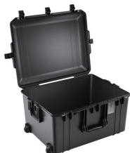
1637NF No Foam