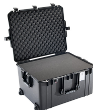
1637WF With Foam