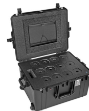
WINE-12B 12-Bottle Wine