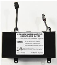
9418Z0 Replacement Battery