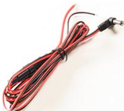
6061F Direct Wiring Rig for Fast Charger