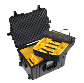
1607WD With Padded Dividers