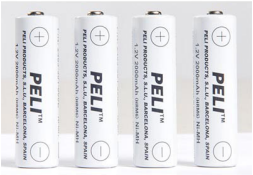
2469P Replacement Battery