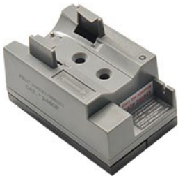
2480F Deck/Dash Charger Base Unit