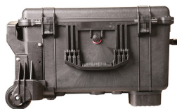
1620MNF No Foam