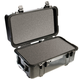
1460WF With Foam