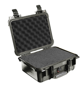
1400WF With Foam