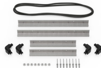
iM2300-BEZEL Base Bezel Kit