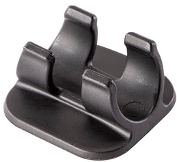
1975H Helmet Light Holder