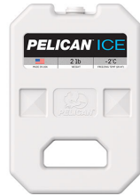
PI-2LB 2lb Ice Pack

Pelican 23215 Early Ave • Torrance, CA 90505 USA • Phone: (310) 326-4700 • (800) 473-5422 • Fax: (310) 326-3311 sales@pelican.com • www.pelican.com