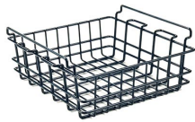
WBLG Dry Rack Basket