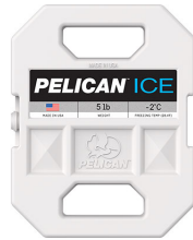
PI-5LB 5lb Ice Pack