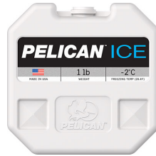
PI-1LB 1lb Ice Pack