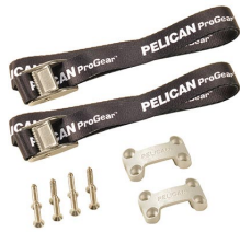
TDKIT Tie Down Kit