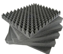
1461 6 pc. Replacement Foam Set