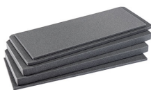
V700FS 4 pc. Replacement Foam Set