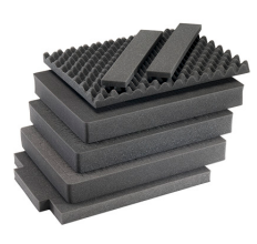
1607AirFS 3 pc. Replacement Foam Set

23215 Early Ave • Torrance, CA 90505 USA • Phone: (310) 326-4700 • (800) 473-5422 • Fax: (310) 326-3311 sales@pelican.com • www.pelican.com