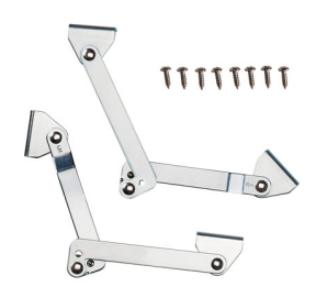
KIT-LIDSTAY-CARGO Cargo Lid Stays