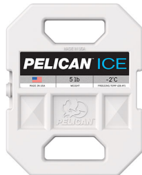
PI-5LB 5lb Ice Pack