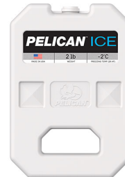
PI-2LB 2lb Ice Pack