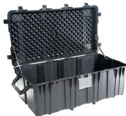
0550NF No Foam