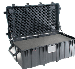
0550WF With Foam